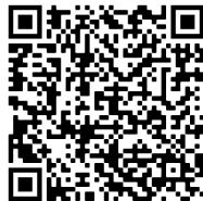
Cut Line Video