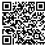
Full Written Tutorial